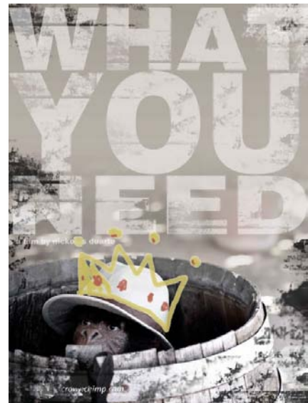
What You Need