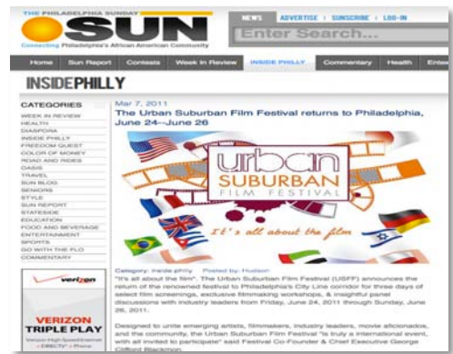
The Philadelphia Sunday Sun 03/07/11