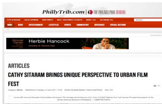
The Philadelphia Tribune 06/21/11