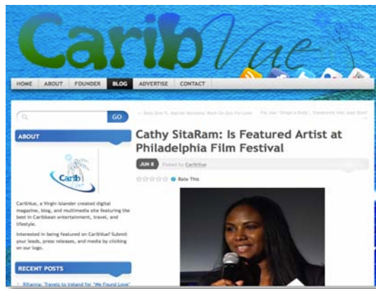
CaribVue Magazine 06/08/11