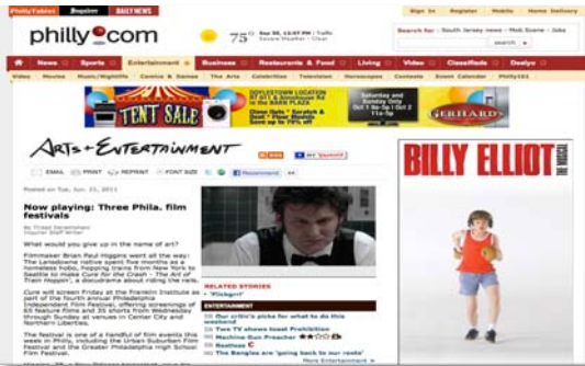
The Philadelphia Inquirer 06/21/11