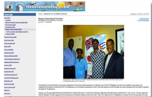
The Bahamas Weekly 06/05/11